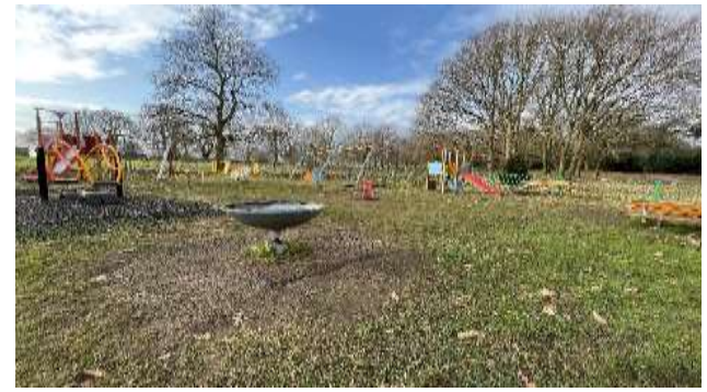
Figure 1: Acton Park Play area

Members of the group held initial site meetings with Wcbc Officers to discuss proposals and seek their views about the practicality of Council looking to build a new playground in a different area of the park and enquire as to whether those proposals might be acceptable to Wcbc.